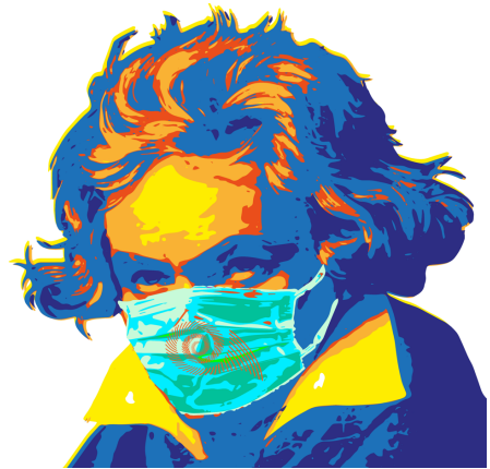
Beat Beethoven 5K