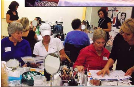
LANCÔME at Belk SouthPark September 17, 2009 Were you there?