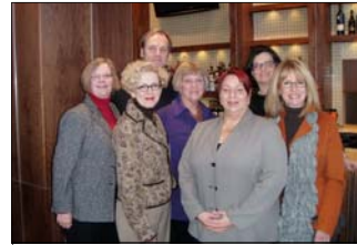
Guild and Met marketing gurus held a press conference.

Our marketing/program team is also hard at work