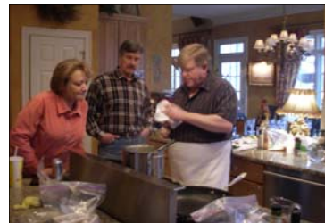
An Elegant Dinner Party February 2010