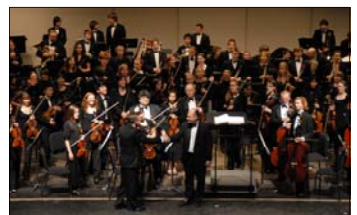
An end to a glorious evening! The CSO and CSYO together.