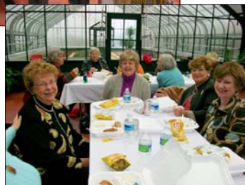
Chinqua Penn Plantation December 2, 2009