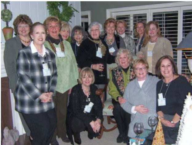
NEW MEMBER AND THEIR MENTORS ENJOY A "FISHY" MEMBER RETREAT

We look forward to getting to know our new members, as they become involved in Guild activities and social events. WELCOME!