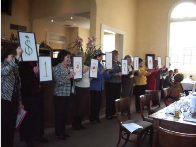
GUILD MAKES OVER $100,000 ON 2005 SHOWHOUSE