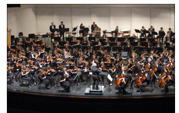
The power of many! The CSO and the CSYO perform together on stage.