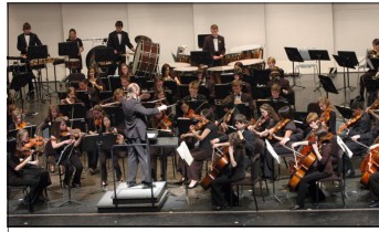
The evening begins with the CSYO