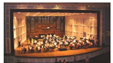
Charlotte Symphony Youth Orchestra in concert.